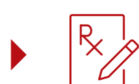
Specialist Service Companies